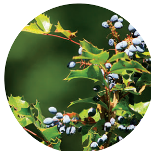
TALL OREGON GRAPE